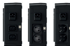
IEC BE/FR NL/LU